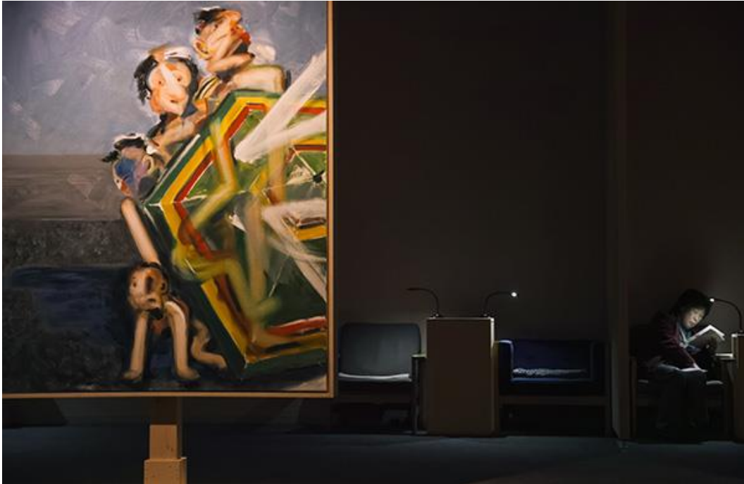
Figure 4: “Conversation Piece” Catalogue, p.26: in a simulated domestic space, with Konishi Noriyuki’s painting and AHA!’s reading corner.