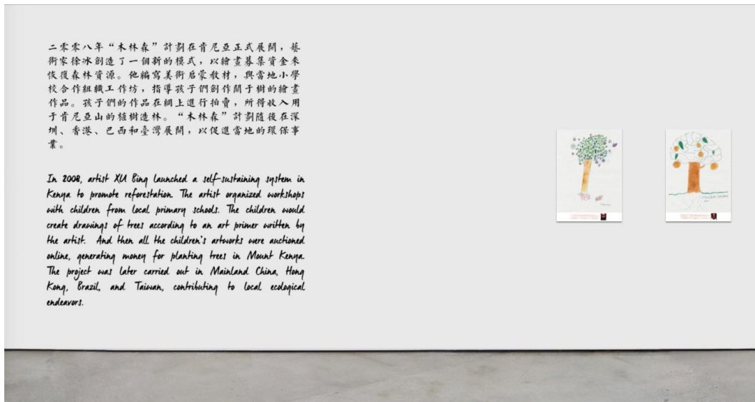
Figure 7: The “Exhibition Wall”: Vertical Browsing.