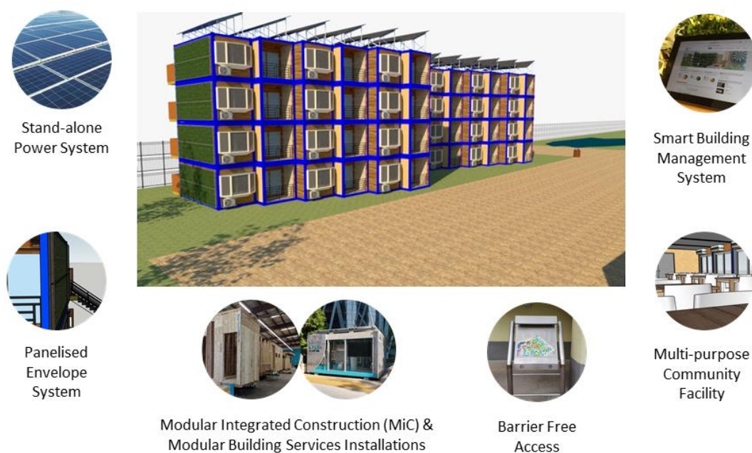
Figure 1. Design concept of TSH using MiC technology.

While it is difficult to develop a “one-size-fits-all” solution for the construction of TSH, the design requirements identified during the prototyping process have enabled the design professionals to develop guiding principles for a user-centric TSH that is comfort for tenants and would be relatively easy for NGOs to operate and manage. Drawing on the on-going discussion of innovative design elements introduced by the Hong Kong Construction Industry Council, the aspiration for creating a design that meets SDG 3, 9, 11 and 13 and the cutting-edge building technologies available in the private sector, we have come up with a list of design concepts that are feasible and compatible with the TSH shown in figure 1. These options are believed to be able to contribute positively to increasing the buildability, adaptability and sustainability of TSH.