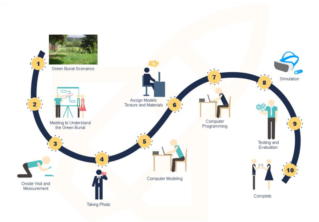
FIGURE 1: THE WORKFLOW OF THE VR FRAMEWORK