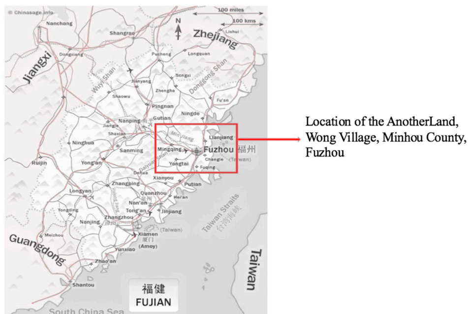
Figure 1. Location of AnotherLand, Minhou County, Fuzhou.

This study adopts an ethnographic approach to explore the lifestyle experiments of a self-organizing community (AnotherLand) in South China. It aims to understand how this self-organizing community maintains its sustainability by developing specific ways of life (internal factors) and building an