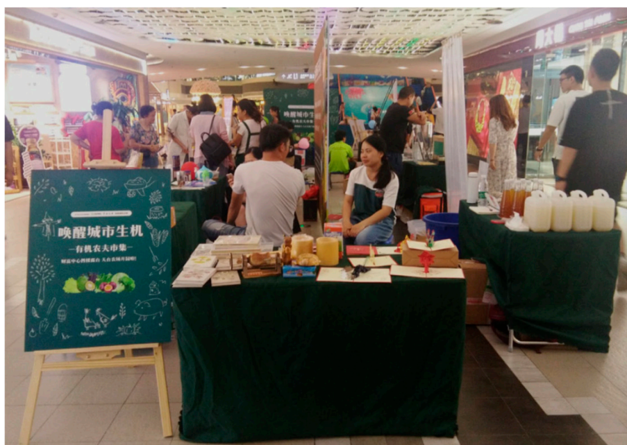
Figure 4. The Farmers Market in Fuzhou.

Ultimately, these independent and interrelated organizations merged into a larger whole, from which the values and rules unique to this integrated field were generated [31]. Since AnotherLand held a strong appeal for the public, it had a great influence on shaping the values in the field. Specifically, AnotherLand's concept of exploring alternative lifestyles and building self-organizing communities has been strongly conveyed to other ecologically themed organizations and the wider public. It played an essential role in connecting resources and attracting investment from the outside world, which contributed to constituting the field as a meaningful world, a world endowed with sense and value, in which it is worth investing one's energy. [32].