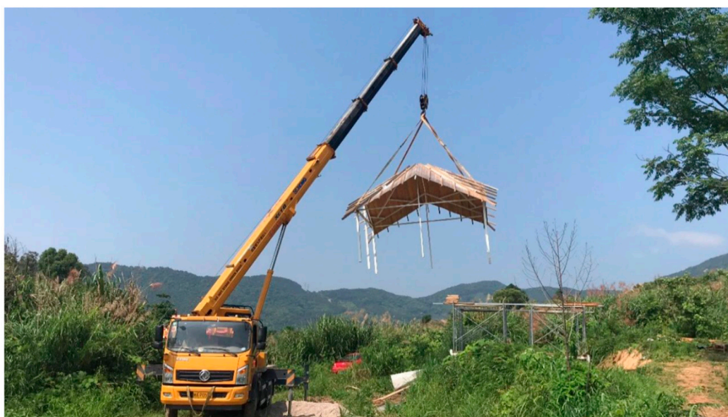
Figure 5. Demolition site of AnotherLand.

Since the land of Wong village belonged to the local government, the construction of this self-organizing community needed to comply with its rules and regulations. For example, the Minhou County government has banned new permanent buildings in its subordinate villages since 2017. This policy led to the dismantling of two ecological buildings of AnotherLand. This can be seen in Figure 5. The local governments asked them to remodel these houses in terms of materials and structures to meet the standards of non-permanent buildings. At the same time, the community also needed to submit the requested documents (e.g., CAD drawings and qualifications) for the new ecological buildings to the Urban and Rural Planning Bureau for administrative review. In the interview, the person in charge of AnotherLand's architecture pointed out that with the increasing popularity of self-organizing communities in recent years, it has become a pioneer of rural transformation in South China.