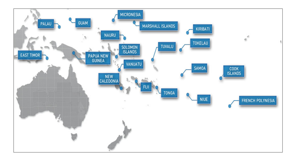
MAP 1 Refined model of travel lifestyle: Chinese tourists in Pacific Small Island Developing States [Colour figure can be viewed at wileyonlinelibrary.com]

Chinese businesses have an increasing presence in the Pacific SIDS in terms of investment in tourism resources such as accommodation. and the Chinese government has also provided development assistance and loans to support improvements in transport infrastructure and the cornerstone facilities such as convention centers. Global spending by Chinese tourists has reached new heights in recent years in 2017 with a total of USD258 billion and ranking number one all tourism source markets (UNWTO, 2018). Pacific SIDS are seeking to attract this lucrative market. Since March 14, 2015, nationals of China and Fiji can enter each other's country without a visa, as agreed by both governments (South Pacific Tourism Organization, 2015). Further initiatives, such as the launch of Fiji's first travel guidebook in Chinese. are expected to attract even more Chinese tourists to Fiji (South Pacific Tourism Organization, 2015). The Cook Islands, Federated States of Micronesia, Niue, Palau, Tuvalu, and Vanuatu offer visa on arrival for Chinese tourists; likewise, other Pacific SIDS, including Fiji, Samoa, and Tonga, offer visa free access travel to Chinese residents (Ministry of Foriegn Affairs, 2017). As Pacific SIDS governments prepare to welcome more Chinese tourists, the questions arise as to whether they are targeting the right market from China and whether they are prepared for the needs of these visitors.