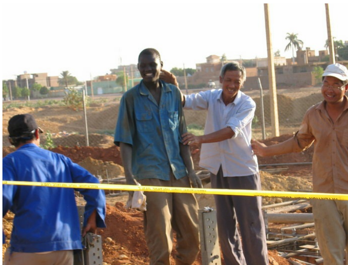
Chinese and Sudanese workers building an extension of power station near Khartoum. Yan Hairong December 2008.

The Chambishi mine is by no means the largest Chinese-owned enterprise in Africa. A private, Chinese-owned conglomerate in Nigeria, with which many PRC SOEs partner in manufacturing and construction, has 20,000 employees, including many Nigerian managers. 99 There are several large PRC-owned factories in Africa, e.g. the Urifiki Textile Mill in Tanzania, with 2000 workers, and shoe and textile factories in Nigeria that employ 1000-2000 workers. 100 Chambishi, however, has been burned into the minds of those exposed to the China-in-Africa discourse.