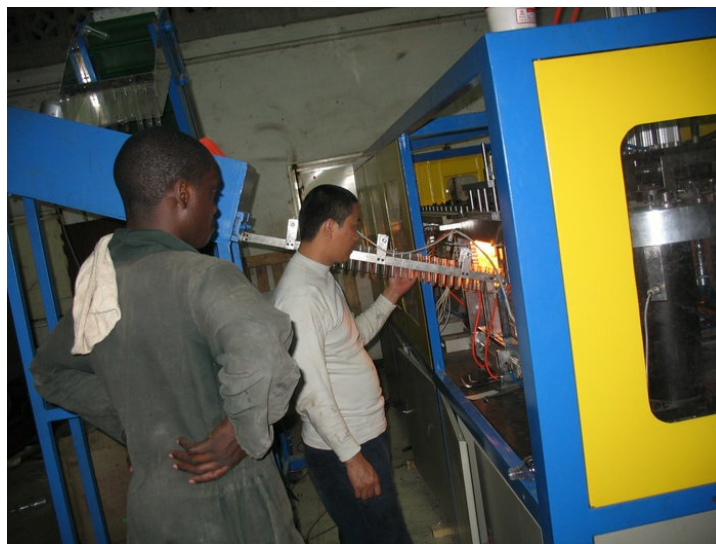
A Chinese demonstrating in a Zambian-owned factory how to use the blow-moulding machine imported from China. Yan Hairong August 2008.

China has worked on African infrastructure for four decades and is becoming its pre-eminent infrastructure builder. The World Bank (WB) estimated that as of mid-2006, China's Export-Import Bank infrastructure loans to Africa were over $12.5b. In 2007, this bank pledged $20b in infrastructure and trade finance loans related to Africa over the next three years (typically tied to the participation of Chinese contractors), on top of the $5b China-Africa Development Fund, announced in 2006 at the third Forum on China-Africa Cooperation, to encourage PRC investment in Africa. 25 While G8 finance ministers have criticized China's loans, on the ground that a "lend and forgive cycle" should be avoided, NGOs point out that only $2.3b of the additional $25b in aid pledged to Africa by rich countries in 2005 has been delivered. 26