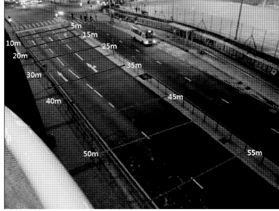
Figure 2 Evaluated view of studied signalized junction from camera

extraction. As vehicles' approaching speed and distance from stop line at the amber onset were obtained via replaying video thereafter, benchmarks in every 5m interval along the pedestrian footpath next to the observed approach were placed. Figure 2 shows the view of studied junction from camera with 5m interval lines overlaid on it. In this study, 15 hours video was filmed in the studied junction during weekdays in which 381 drivers were recorded providing data for this study. Parameters describing subject vehicles at the instance of amber onset including approaching speed, vehicle distance from stop bar at the instance of amber onset, vehicle type and drivers' STOP/GO decision were recorded providing the focus data of this study. Of the 381 drivers observed in this junction, 210 drivers opt to GO and 171 drivers opt to STOP with average approaching speed at 45kph. It is important to highlight that 60 percentile of approaching speed is at 49kph, that's mean approximately 40% of drivers manoeuvre over speed limit (50kph) in the studied junction.