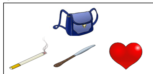
Figure 1: An example of the rime detection task.

For instance, in the rime detection task, after hearing the target sound, bao 1 (bag), and the other three sound choices, yan 1 (cigarette), dao 1 (knife) and xin 1 (heart), children were asked to select the similar one from the three choices and to point at the corresponding picture (see Fig. 1). In this case, the answer is dao 1 (knife), because the target syllable bao 1 (bag) and dao 1 (knife) share the same rime, i.e., ao 1 . Similarly, in the onset detection task, the target sound hei 1 (black), the correct choice hua 1 (flower), and two other distracter choices ji 1 (chicken) and che 1 (car) were randomly presented to child participants.