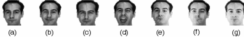
Figure 5. Some sample images of one subject in the AR database.