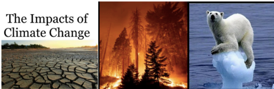
Figure 2. Nudging message in the questionnaire.

Imagine you are planning a [response to question 1.3] days leisure trip with [response to question 1.5] persons. You will select a destination that you prefer and go there by plane during October and November. The average temperature in Hong Kong at that time is 23~26°C. When you are making the travel plan, you see a piece of news about carbon emissions on social media: Carbon dioxide emissions have had severe impacts on the entire world. According to the Intergovernmental Panel on Climate Change (IPCC), continued carbon emissions largely determine global warming and increase the likelihood of severe, pervasive and irreversible impacts on ecosystems, including more frequent wildfires and extreme weather, accelerated sea-level rise and mass extinction of species etc. Travel activities are also affected by global climate change which is caused by excessive carbon dioxide emissions. Everyone has the responsibility to take action to reduce carbon emissions for environmental protection and sustainable tourism development.