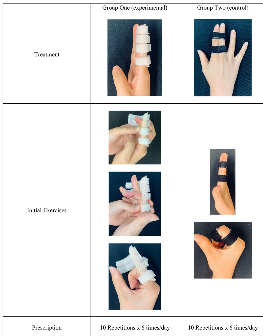
Fig. 2 Intervention of experimental and control groups

shown to be consistently reliable when standardised methods are implemented [18].