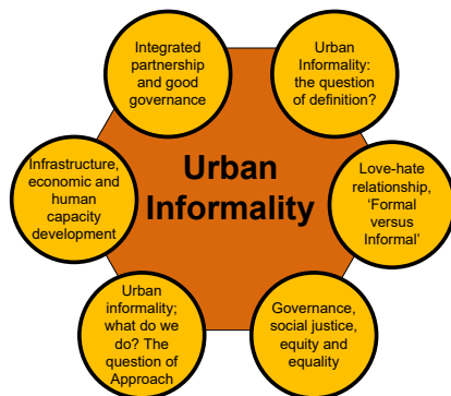
Figure 1. The concept of urban informality

Considering, the challenges of urban informality and infrastructure in Lagos metropolis and Hong Kong from the literature perspective above and the need to achieve the aim of sustainable urban strategies in this study. Figure 1 and 2 below describes the concept of urban informality and infrastructure integration as the research framework of this study. The figures illustrate the concept and factors of urban informality and infrastructure integration in the study area and describe the strategy for integrating the professional perspectives of ameliorating the challenges of urban informality and infrastructure planning. The concept emphasizes the integration of urban informal and formal with infrastructure for sustainable settlement (the people and the area) development.