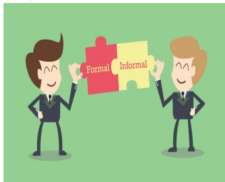
Figure 2. Urban informality and infrastructure integration