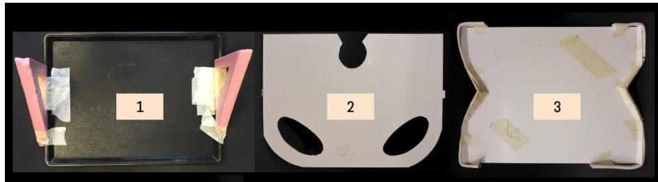
Fig. 2. Initial three prototypes.

area while removing some of the edges. The butterfly grip area was created to support the grip while correcting awkward wrist posture and the flattened edges were created to improve the eating experience.