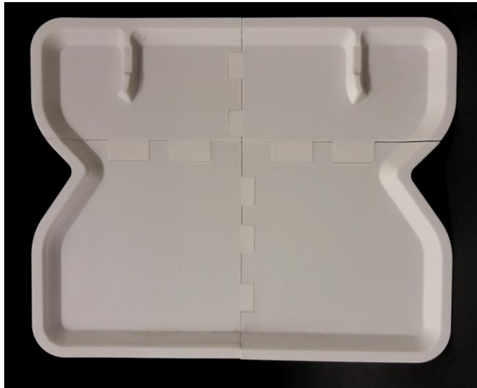
Fig. 4. 3D printed prototype without the slip-resistant material applied.

designated space for drinks, elevated cutlery rests to ensure the hygiene of the cutlery, and anti-slip material to assist in keeping the food and drink from spilling. Based on the rapid user testing, the grip area was developed further, and the bottom corners were recessed to avoid pain while eating but without lowering to the point where dishes may fall off the tray. Additionally, notches to hold the cutlery were added and a slip-resistant surface to hold dishes firmly was applied. Following the rapid prototyping, a 3D printed prototype was assembled for a final user testing session (see Figure 4). This prototype was covered fully with slip-resistant silicone.