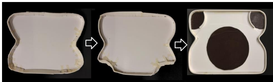
Fig. 3. Initial rapid iterations of prototypes used for testing.

Based on the findings from the initial prototype testing, prototype 3 was chosen to be expanded upon as the butterfly-shaped grip area provided a neutral position for the wrist and caused users to hold the tray closer to their body and in a more ideal position. Additionally, the butterfly-shape afforded comfort for both smaller hands and larger hands. Moreover, the space lost with the new grip design was considered acceptable to users. Finally, anti-slip materials and raised spaces for cutlery were added based on the original design criteria.