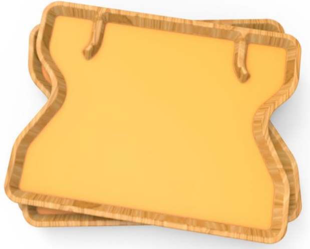
Fig. 5. Final design of the food tray.

length, and thickness so that current machinery will remain useful. The design is also stackable for easy storage.