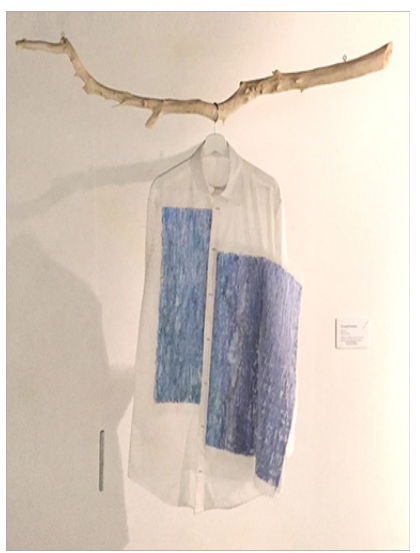
Figure 5 Research prototype Textural Dynamics.