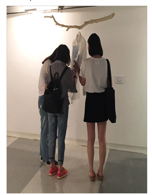
Figure 7 Audiences actively interacting with Textural Dynamics in exhibition.

The direct observation is proposed to be done simultaneously with the semi-structured interview and expert interview. The human-artefact interaction will be observed with a preset observation protocol when the subjects are presented with the realized creations. The observation foci are located on the person, objects, situation, time and activity. A questionnaire will be given to the exhibition audiences in order