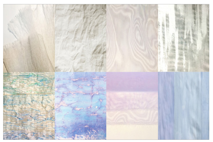
Figure 3 Mono-sensitive swatches developed.

After considering the situational suitability, a selected initial proposal was refined by integrating the results attained in the multisensitive textile development process. Supported by the previous stages, the research prototyping phase was smoothly conducted with enhanced design sophistication. A dual-sensitive panel (Figure 4) was recreated with additional hand embroidery and texture enhanced layer and further applied to the critical design practice resulting in the research prototype, Textural Dynamics (Figure 5). Functioning as an in-stage implementation, the attire was cautiously designed and artfully created to give a physical form to the established idea in a balanced, pragmatic and holistic practice. Figure 6 shows the different reactive behaviors and hence the diverse appearances that the realized prototype affords. Equipped with the right exhibition setting and tools, for example, ultraviolet laser pointer, the audience is entitled a high level of user autonomy. Since the audience is able to manipulate the appearance of the attire and temporarily compose a customized signifier, a higher level of interactivity, thus, an enhanced human-artefact engagement and the corresponding user-experience are anticipated. Nevertheless, the hypothesis is to be proven by further empirical study.