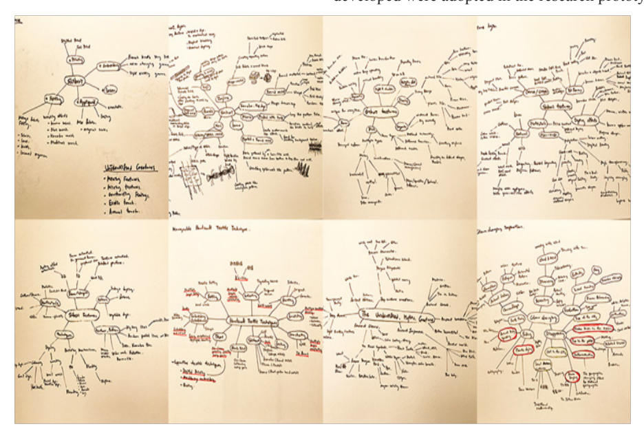
Figure 1 Mind-mapping and rapid ideation.

other, the prototyping phase was then proceeded to the secondary level resulting in a dual-sensitive swatch.<sup>13</sup> Step by step, the transparent polyester organza was coated with azure thermo chromic pigments and transparent-green luminescent coating on the right and wrong side respectively. The fabric was then gathered and secured by rolls of running stitches similar to the resisting mechanism of the traditional Japanese textile craftsmanship, Nui Shibori. Another layer of transparent-azure luminescent coating with higher viscosity was applied onto the surface of the gathered panel. Cracks, which allow the transparent-green luminescent coating on the wrong side of the fabric to be visible from the right side, were created on the azure thermo chromic layer along the gathers as a result of imbalanced viscosity between coatings. The hybrid swatch developed reacts to ambient thermo- and photo- stimuli and displays dynamically different visuals. The surface changes from shades of azure to light grey in contact with heat, and reacts to ultraviolet light resulting in temporary glowing surface of luminescent azure and green. Proven feasible by the secondary prototyping, the procedures and mechanism developed were adopted in the research prototyping phase.