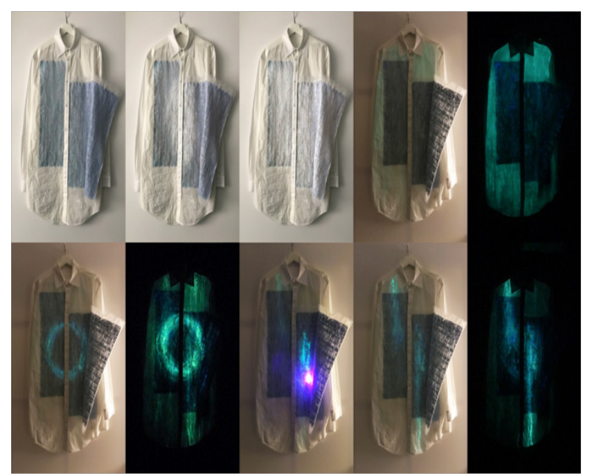
Figure 6 Textural Dynamics under different environmental conditions.

interview, is suggested. The case study aims to collect dominating qualitative and subordinate quantitative data, followed by content and statistic analyses respectively.