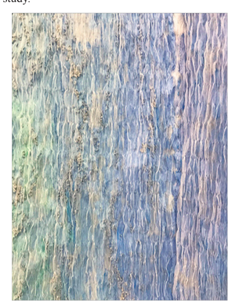
Figure 4 Dual-sensitive panel.

After considering the situational suitability, a selected initial proposal was refined by integrating the results attained in the multisensitive textile development process. Supported by the previous stages, the research prototyping phase was smoothly conducted with enhanced design sophistication. A dual-sensitive panel (Figure 4) was recreated with additional hand embroidery and texture enhanced layer and further applied to the critical design practice resulting in the research prototype, Textural Dynamics (Figure 5). Functioning as an in-stage implementation, the attire was cautiously designed and artfully created to give a physical form to the established idea in a balanced, pragmatic and holistic practice. Figure 6 shows the different reactive behaviors and hence the diverse appearances that the realized prototype affords. Equipped with the right exhibition setting and tools, for example, ultraviolet laser pointer, the audience is entitled a high level of user autonomy. Since the audience is able to manipulate the appearance of the attire and temporarily compose a customized signifier, a higher level of interactivity, thus, an enhanced human-artefact engagement and the corresponding user-experience are anticipated. Nevertheless, the hypothesis is to be proven by further empirical study.