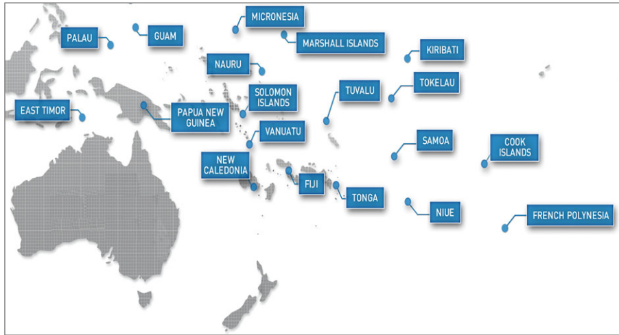
MAP 1 Refined model of travel lifestyle: Chinese tourists in Pacific Small Island Developing States [Colour figure can be viewed at wileyonlinelibrary.com ]

Chinese businesses have an increasing presence in the Pacific SIDS in terms of investment in tourism resources such as accommodation, and the Chinese government has also provided development assistance and loans to support improvements in transport infrastructure and the cornerstone facilities such as convention centers. Global spending by Chinese tourists has reached new heights in recent years in 2017 with a total of USD258 billion and ranking number one all tourism source markets (UNWTO, 2018). Pacific SIDS are seeking to attract this lucrative market. Since March 14, 2015, nationals of China and Fiji can enter each other's country without a visa, as agreed by both governments (South Pacific Tourism Organization, 2015). Further initiatives, such as the launch of Fiji's first travel guidebook in Chinese, are expected to attract even more Chinese tourists to Fiji (South Pacific Tourism Organization, 2015). The Cook Islands, Federated States of Micronesia, Niue, Palau, Tuvalu, and Vanuatu offer visa on arrival for Chinese tourists; likewise, other Pacific SIDS, including Fiji, Samoa, and Tonga, offer visa free access travel to Chinese residents (Ministry of Foreign Affairs, 2017). As Pacific SIDS governments prepare to welcome more Chinese tourists, the questions arise as to whether they are targeting the right market from China and whether they are prepared for the needs of these visitors.