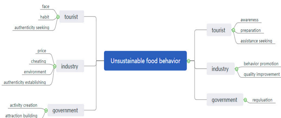
Figure 1. Causes of unsustainable food consumption and the proposed countermeasures.

After data collection, two researchers read and reread the text data independently to get familiarity with the content written by the participants before the coding process. Then the researchers systematically coded the data by themselves to reduce the large quantity of information to smaller meaningful units. This was followed by the step of grouping common codes to a specific them when major dimensions involved in unsustainable food consumption in travel and related measures to address the issue were identified. The coding results from both researchers were compared, and if discrepancies emerged, another researcher was invited to discuss the difference and help to finalize the coding. Thus, research validity can be reached. Finally, the dimensions presented in the study were written together with the related illustration and quotation. In all, the processing of the data involved the aforementioned 5 distinctive steps. Figure 1 presents the final results of the study. Based on participants' opinions, three stakeholders, namely, tourists, industry, and government, all contribute to major attributes, leading to unsustainable food consumption in travel. Meanwhile, countermeasures are suggested as well after the coding process is used to code the major dimensions.