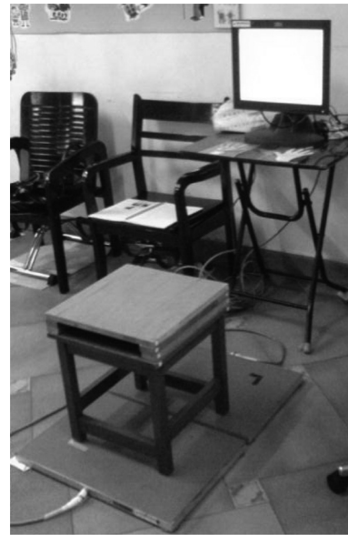
Fig. 2. Equipment setup for the sequential weight-shifting (SWS) test

appeared. The 10 targets appeared in eight locations (Fig. 1). The distance from the center to each target was normalized according to the participant's individual height and was determined using the normalized body sway angle. The normalized body sway angles were calculated from the data of 22 older adults of similar mobility level (FAC=0–2), collected in a previous study, and twenty-fifth percentiles of their limits of stability were chosen to position the target locations.