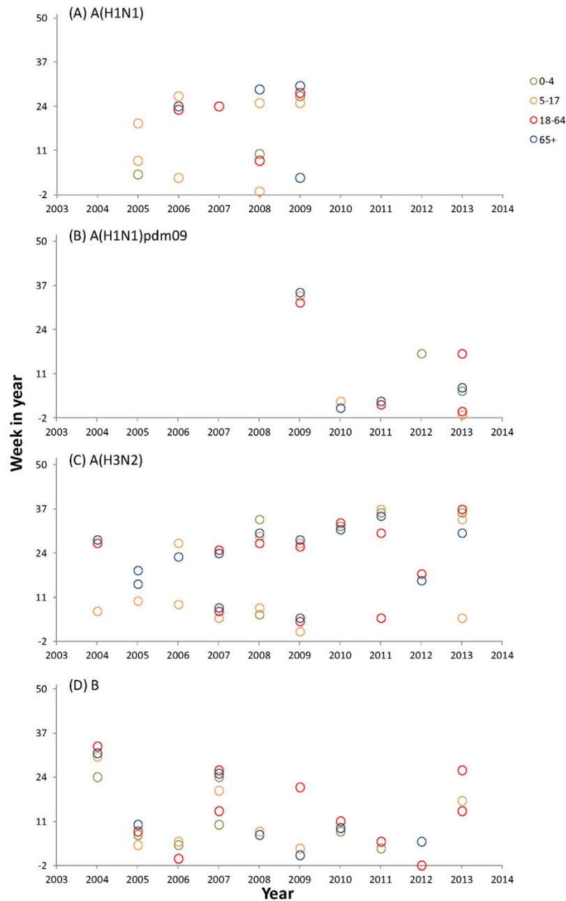
Figure 3. Onset time of influenza epidemics of (A) A(H1N1), (B) A(H1N1)pdm09, (C) A(H3N2) and (D) B, in cool or warm season of each year by age groups, 2004–2013. Week number ranges from -2 to 50, with negative indicating the weeks before that corresponding year (i.e. -2 represents week 50 of last year). Warm season is defined as week 19 to week 50, and cool season as week 51 to week 18 of next year. Threshold for epidemic is set at 4% of annual total age-virus-specific positive cases.

reliably reflect the true variation of influenza cases within each age-virus group. Second, our data were obtained from people who sought for medical treatment in two hospitals, thereby likely representing relatively more severe cases. Therefore our results may not reflect the relative timing of virus activity across different age groups in community outbreaks. To better understand the age pattern of all infected cases, ideally a random sample of people with influenza-like symptoms should be drawn from the community, but such a study can be hindered by enormous demands on financial cost and manpower. Nevertheless, age pattern of infected cases that required medical treatment still provides valuable information on age profile of different respiratory viruses and can thus facilitate the formulation of control measures specifically targeting on different age groups.