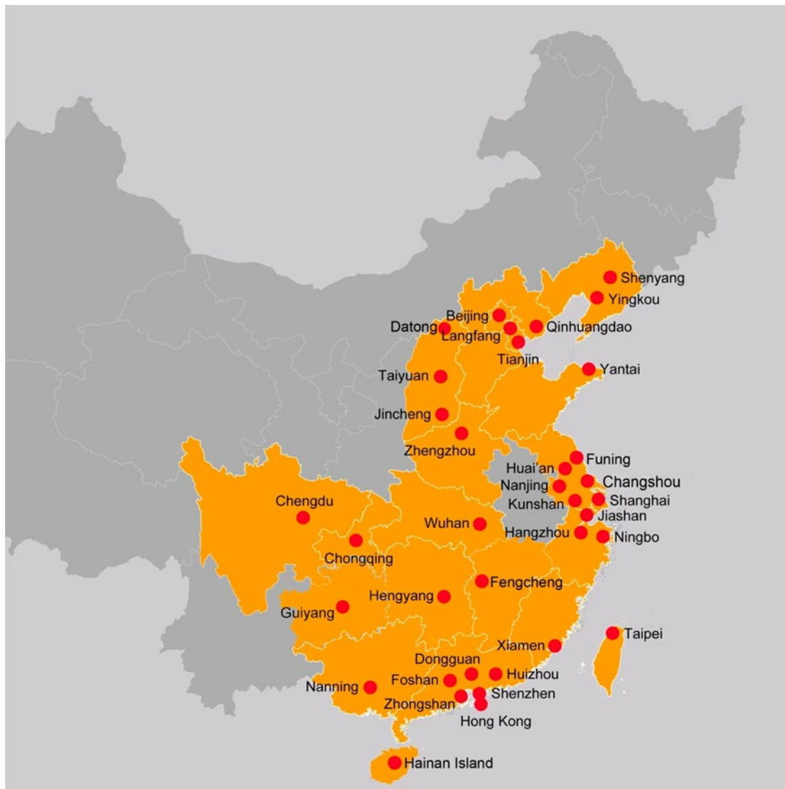
Figure 2. Foxconn China locations, 1974–2016.

Foxconn is China's biggest industrial employer. After reaching its first 100,000 employees in 2003, it rapidly expanded to more than 700,000 in 2008. Its resilience in the economic downturn of 2008 is shown by the astonishing increase in the size of the labor force, reaching 1,000,000 in 2010. With new operations in northern, central, western, and southwestern regions, the number of Foxconn workers and staff continued to grow to 1.3 million in 2012, then hover at around 1 million in recent years. In Foxconn China, over 85% of employees are rural migrants between 16 and 29 years old, according to a mid-level human resources manager. [3]